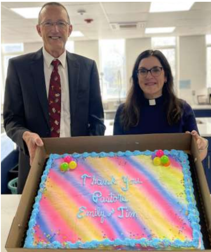
Celebrating Pastor Appreciation Day!