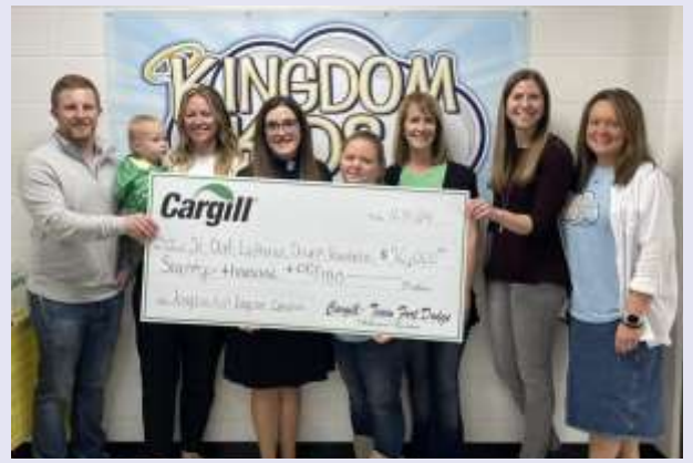
All of us at St. Olaf are so overjoyed at the outpouring of support from our Fort Dodge community. This generous gift came from Cargill in the amount of $70,000 for our Kingdom Kids Daycare. Thank you Cargill!