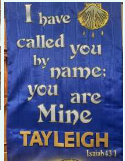
Our new baptism banner