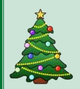
OWLS CHRISTMAS PARTY