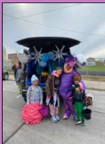
The Life & Growth Committee sponsored this fun event!