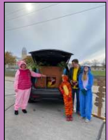
It was held on Sunday, October 29.