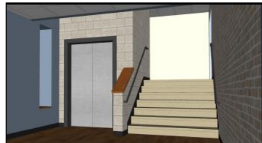
Elevator Inside Daycare Entrance